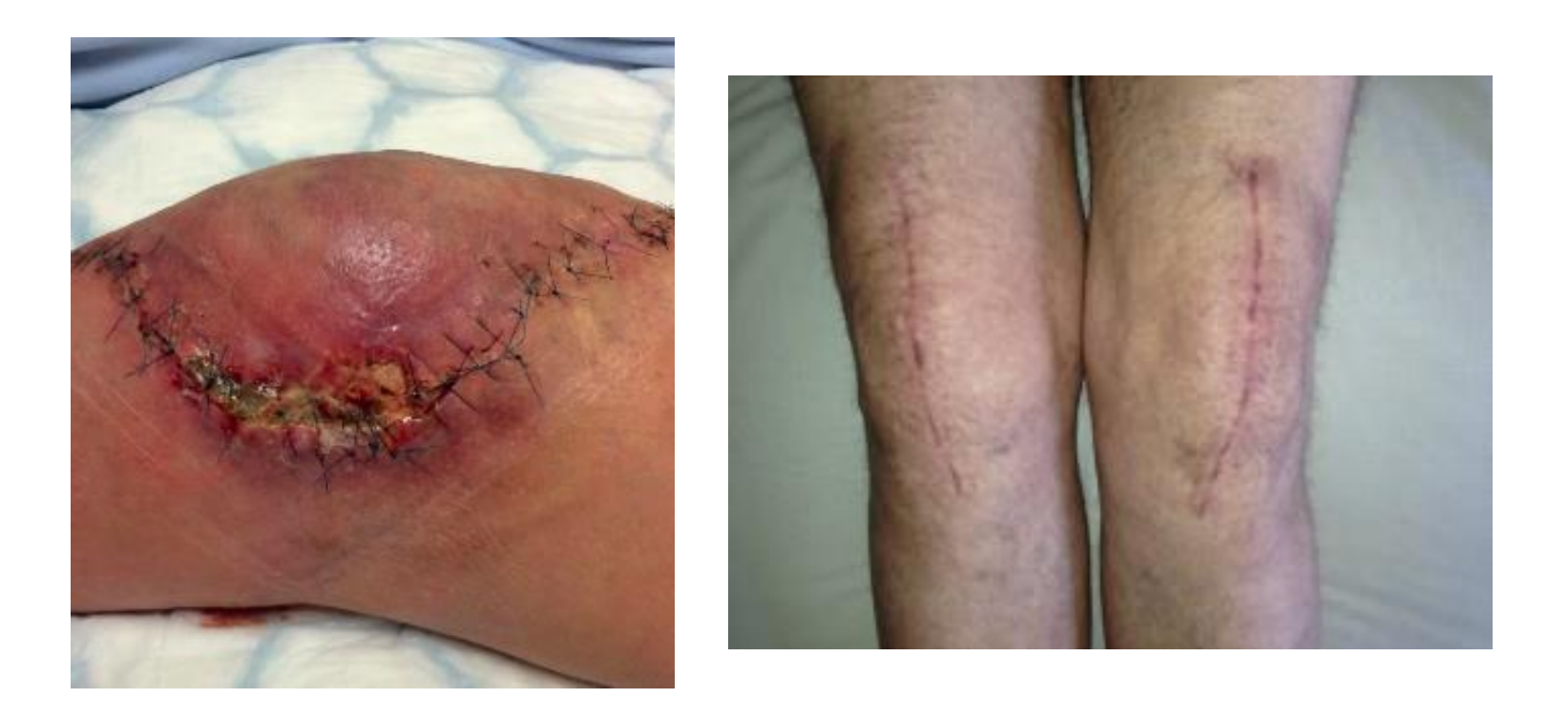
Photo 1: Ola Rolfson Photo 2: http://www.findyourbalance.ca/physiotherapy/post-op-rehab/total-knee-replacement/